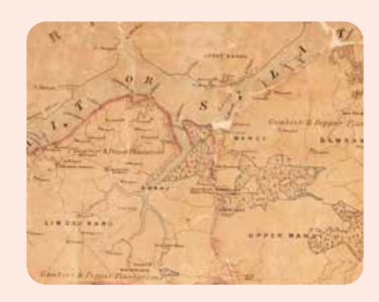
CLOSE-UP OF THE MAP OF THE ISLAND OF SINGAPORE AND ITS DEPENDENCIES

The print is one of four forest scenes in Skizzen aus Singapur und Djohor depicting the tall forest trees that were becoming increasingly scarce by the 1870s.